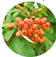
urajironanakamado ( Sorbus matsumurana )