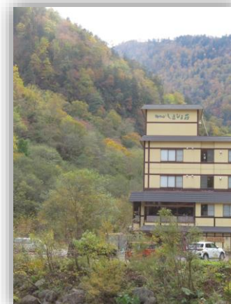
Shikishimasō and chuubetu river