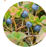
kurousugo ( Vaccinium ovalifolium )