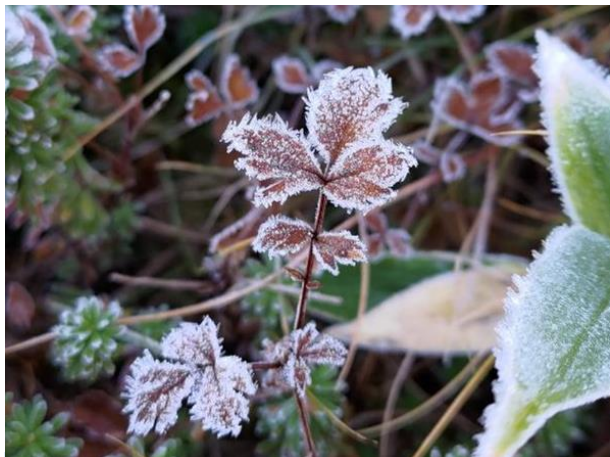
Plant leaves with frost

Morning temperatures have been dropping below 0 degrees Celsius more and more often at Sugatami Pond Park. If you take a walk in the morning, you can see frozen ponds and frost-covered plants, which are beautiful. In the afternoon, the frost and ice will melt, and the paths will become muddy, so rain boots are highly recommended. We do rent rain boots; one pair for 300 yen.