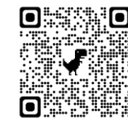
Daisetsuzan Nature School