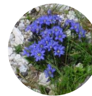
Miyamarindou ( Gentiana nipponica )