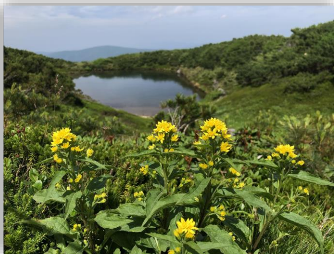
Miyamaakinokirinsou ( Solidago virgaurea ssp. leiocarpa ) and Mangetunuma

You can see a lot of Aleutian avens (fluff) and Solidago virgaurea subsp. leiocarpa . It seems like alpine flowers are blooming earlier than usual. Although the temperature is lower than in town, direct sunlight is very strong. Please come prepared to avoid heatstroke.