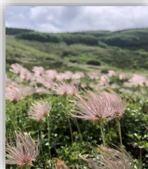
Aleutian avens ( fluff )