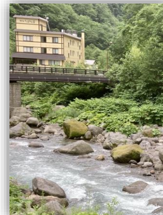
Shikishimasō and chuubetu river