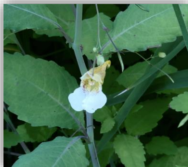
Kiturifune ( Impatiens noli-tangere L)