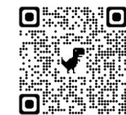
Daisetsuzan Nature School