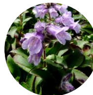
Iwabukuro ( Pennellianthus frutescens )