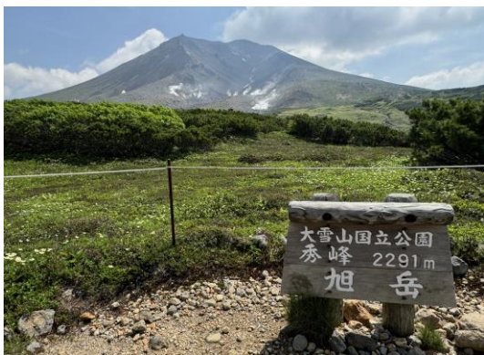
The colony of Aleutian avens

Because snow melted 10 days earlier than usual, flowers are blooming a week to 10 days earlier this year. Also, perhaps because they were exposed to low temperatures after the snow melted, the volume of flowers seems to be slightly smaller. However, the flowers at Sugatami Pond Garden are constantly changing, and the liveliness remains the same. From now on, the Ezoisotsutsuji will be in full bloom. Please come to Mt Asahidake to enjoy refreshing breezes and stunning views.