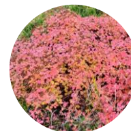
Ezonomarubashimotsuke ( Spiraea betulifolia var. aemiliana )