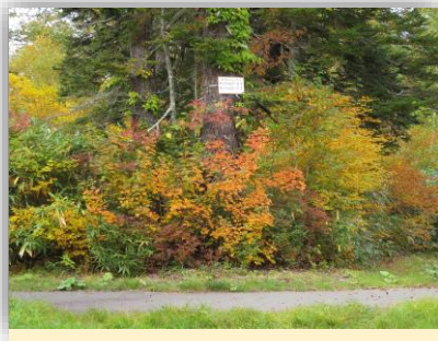
Autumn leaves on trails in Campsite