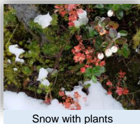
Snow with plants