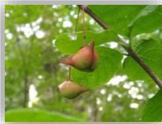
Fruits of Kurotsuribana ( Euonymus tricarplus )

Trails • Alpine Botanical Garden • Onsen • Campsite