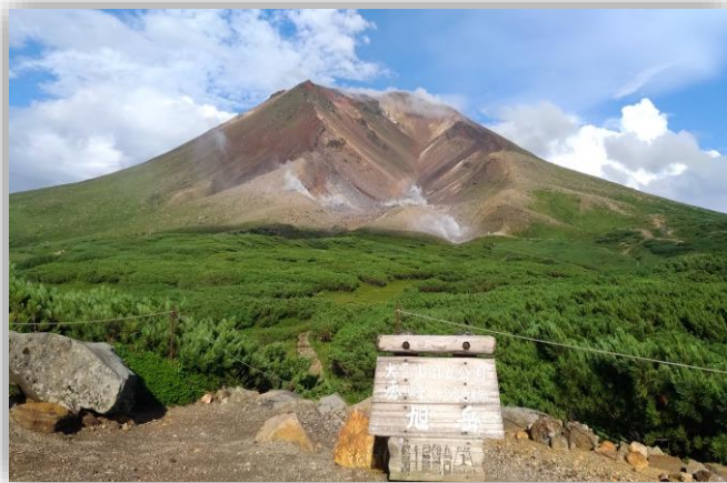
Mt. Asahidake after a thunderstorm