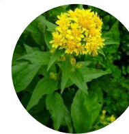
European Goldenrod ( S. v. var. asiatica )