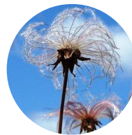
Fluff of Aleutian Avens