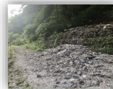
The gravels on the trail