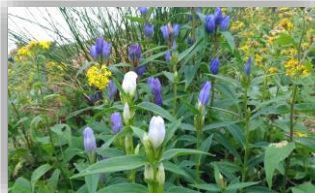
Ezo-Oyama-Rindou ( G. t. var. j. f. montana )