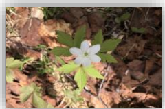
Ezoichige ( Anemone yezoensis )