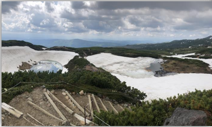
Meoto pond (Left: Suribachi Pond ; Right: Kagami pond)