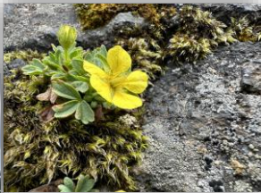
Meakankinbai ( Sibaldia myabei )