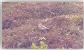
Pine grosbeak (♀)