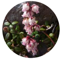
Komebatsugazakura ( Arctericia nana )