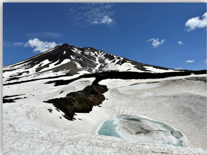
Suribachi pond and Mt. Asahidake

The snow is melting while alpine plants are starting to bloom and birds are starting to sing on the trails of Sugatami. Suribachi pond is revealing their face in emerald green under the snow. The trails are snowy and muddy. We are offering Rain boots(300 ¥/pair) to prevent from your shoes getting wet. There are many plants living under the snow, so please walk only on the trail!