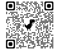
Daisetsuzan Nature School