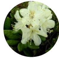
Kibanasyakunage ( Rhododendron aureum )