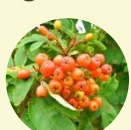
Japanese Rowan Berries