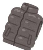
Light down jacket