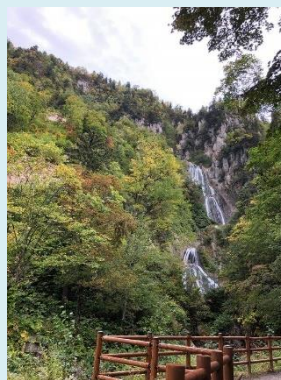
『Hagoromo Waterfall Photo from 9/22』

You see Hagoromo waterfall from the end of the walking trail and before long the leaves will start changing color.