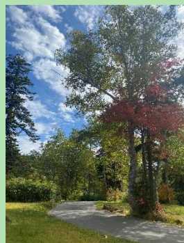
『Autumn colors at the campsite』