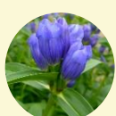
Hokkaido Royal Gentians