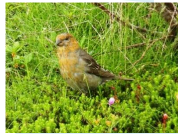
Pine grosbeak ♀

Sugatami Area: Current Conditions: One loop is 1.7km and approximately 1 hour. Along the walking path the Sieversiapentapetala flower is blossoming in great abundance. There is a rich diversity of over 30 different alpine flowers currently in blossom. Some of the mammals you may see include the Siberian Chipmunk, Ezo red fox, and Ezo mountain hare. Some of the alpine birds you may see include the Siberian rubythroat and pine grosbeak. Take caution when resting, ravens love opening your bag zippers and take your food, even wrappers! This leaves garbage in remote areas.