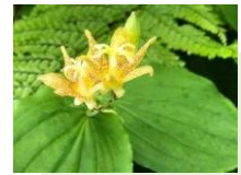
Tricyrtis latifolia var. makinoana