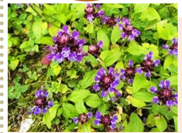
Prunella vulgaris ssp. asiatica

Asahidake Onsen area also has paths for exploration, such as around the Campground. You can see different wild plants and search for birds. We recommend the "Yukomanbetsu" Botanical Garden. Learn more details about the National Park at the Asahidake Visitor Center. It's a beaut!