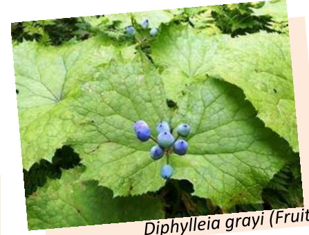
Diphylleia grayi (Fruit)