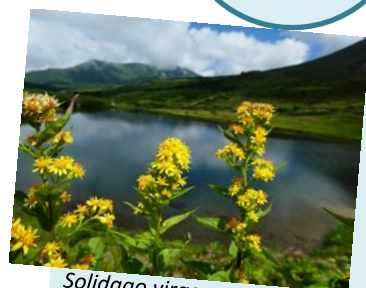
Solidago virgaurea ssp. asiatica