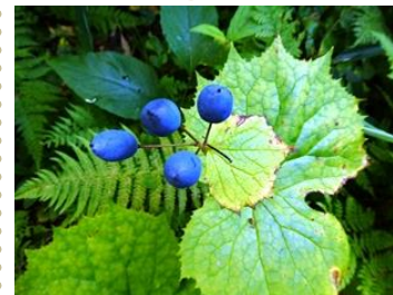
Diphyllaea grayi (fluit)