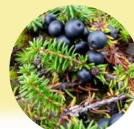
Empetrum nigrum var. japonicum (fluit)