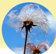
Sieversia pentapetala (fluff)