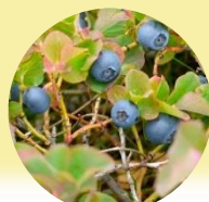
Vaccinium ovalifolium (fluit)