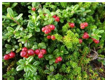
Vaccinium vitis-idaea (fluit)