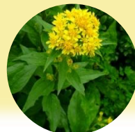
Solidago virgaurea ssp. asiatica