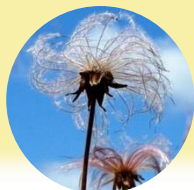
Sieversia Pentapetala (fluff)