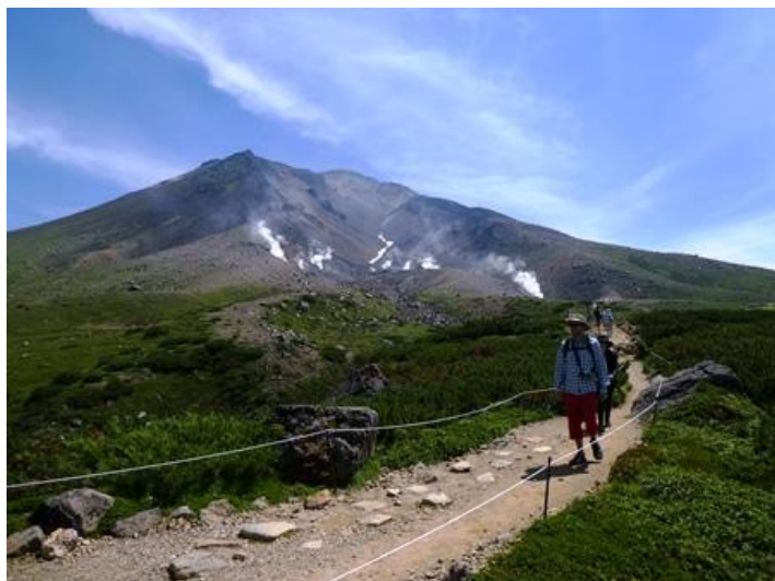
View of Asahidake from the 4th observation platform