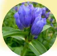
Gentiana triflora var. japonica f. montana