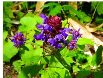
Prunella vulgaris ssp. asiatica