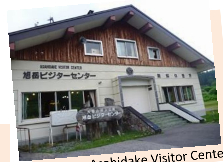
Asahidake Visitor Center

For information about hiking around Asahidake, sightseeing trails in the area, or other such inquiries, please contact the Asahidake visitor center. It also has a resting area and exhibition corner.