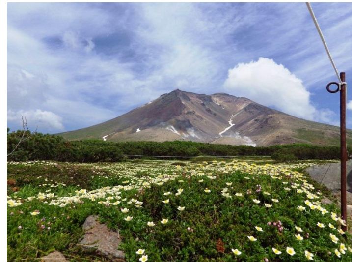
Sieversia pentapetala and Asahidake