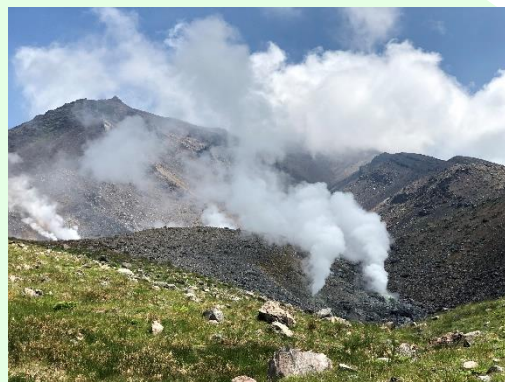
『Fumaroles and Asahidake』