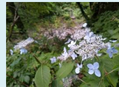
←Hagoromo Waterfall Aug.5th

You get free parking near the foot onsen, which is also free of charge to use. Come enjoy that after you hike to the tallest waterfall in all of Hokkaido. There is also Shikashima Hotel/Onsen that's right across the way. Remember one thing, there is NO restroom along the hiking route, so please plan ahead.