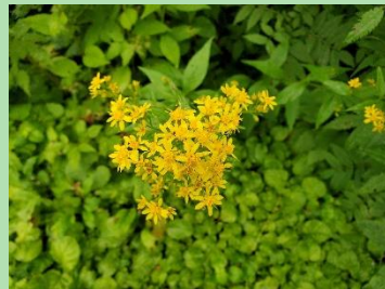
『Solidago virgaurea ssp. Asiatica』

The Asahidake campground is also home to a variety of alpine plants. You can enjoy strolls here free of charge and it's easily accessible. Come talk to the camp manager for tips.