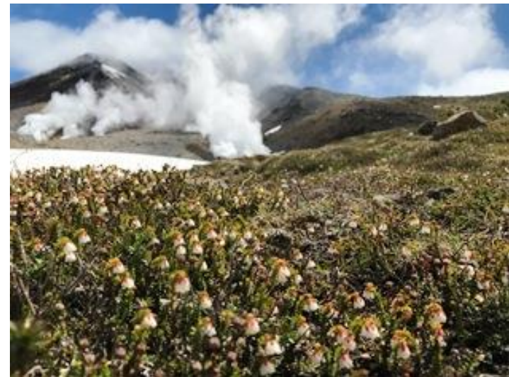
Harrimanella stelleriana and Mt. Asahidake