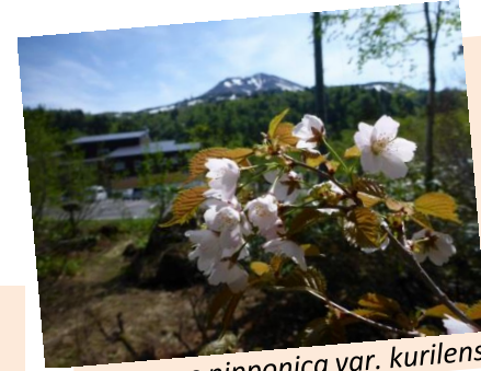
Prunus nipponica var. kurilensis

The latest Sakura in Japan is now blooming. In Yukomanbetsu wetland near the bottom ropeway station, Caltha fistulosa can be seen from the boardwalk.