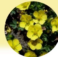
Empetrum nigrum var. japonicum